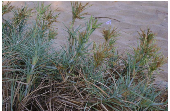
FIGURE 4. Spinifex littoreus (Burm. f.) Merr.