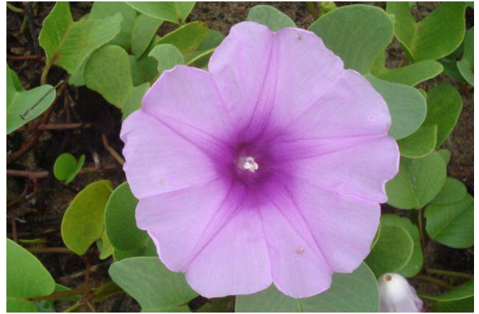
FIGURE 2. Ipomoea pes-caprae L. R. Br.

As several authors have pointed out in various parts of the world, many dune ecosystems support high plant richness and diversity values ( e.g. Musila et al. 2001; Grootjans et al. 2004; Fontana 2005; Celsi and Monserrat 2008). In this sense, the present work also indicates that the study area preserves a rich flora with high number of native dune plants. Moreover, the different vegetation formations together with the dune field geomorphologic heterogeneity provide a wide variety of environmental conditions and habitat types that support a diverse native fauna like Crabs, Dune Lizards etc. The conservation of the native vegetation of the CSD is a priority to conserve the integrity of the natural communities in coastal regions.