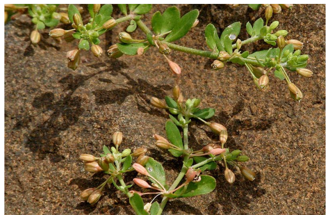
FIGURE 5. Glinus oppositifolius (L.) A. DC.