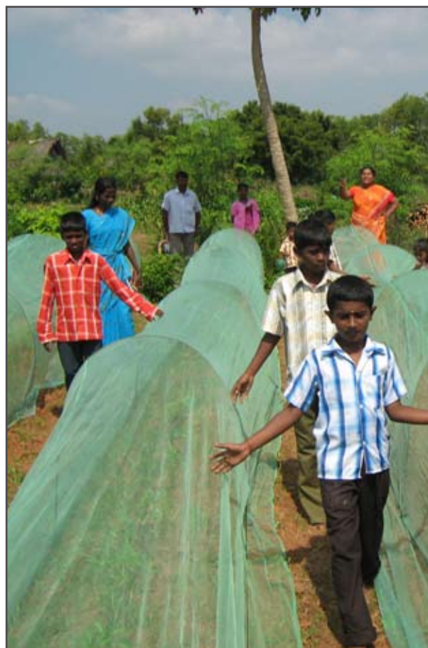
Exposure visit to the Botanical Gardens

Approximately 180 government and private school teachers, 40 AV Outreach school teachers and 10 ACDC night school teachers took part in the Green Teacher Training Programme. Through this programme the teachers learnt: how to form Eco Clubs and organise activities for them; what a teacher can do at the individual and community level to reduce global warming; how to include what they have learnt in their teaching and the school curriculum. The programme received a positive response from all the teachers who participated. Several of them, on their own initiative, started herbal gardens and tree planting in their schools.