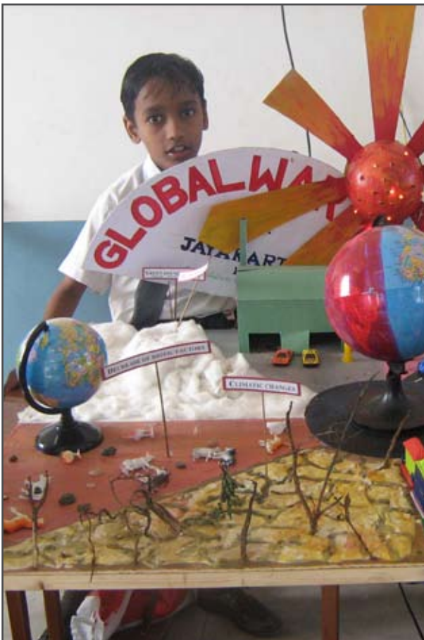
Student proudly presenting his model

The Young Scientist Festival was organised, where a science exhibition on environmental issues, such as global warming was on display. One hundred and twenty-five schools participated, including 1,000 students, and over 700 headmasters, teachers, and trainees. A large variety of models and experiments were displayed in booths by the teachers and students. These experiments had been developed as part of the schools' Eco Education Programmes. Some students performed plays, dances and songs with themes related to science and the environment. The festival gave the students an opportunity to explore their skills, to share their models with others and to acquire deeper scientific knowledge. Around 800 people visited the exhibition and showed great interest. The Young Scientist Festival was featured in local newspapers.