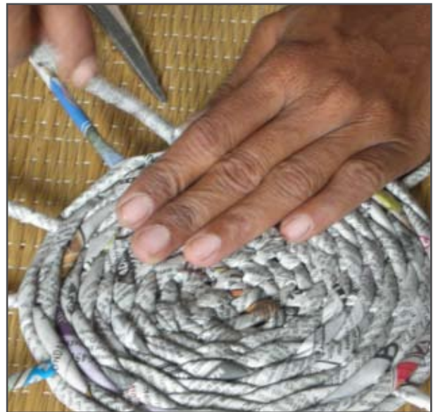
Weaving a basket with newspaper reeds