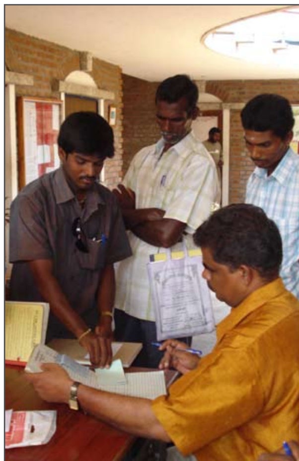
Grading of MSHGs

There has been a change in what MSHG members take loans for. An increasing number now take loans to start or build up income generating enterprises. 18% of loans taken by MSHG members are used for agriculture and 11% go towards their children's education.