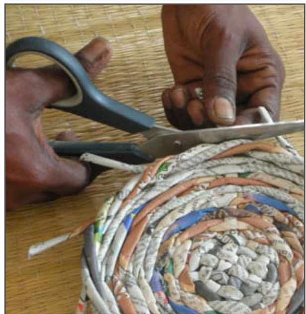
Preparing the base for a woven basket