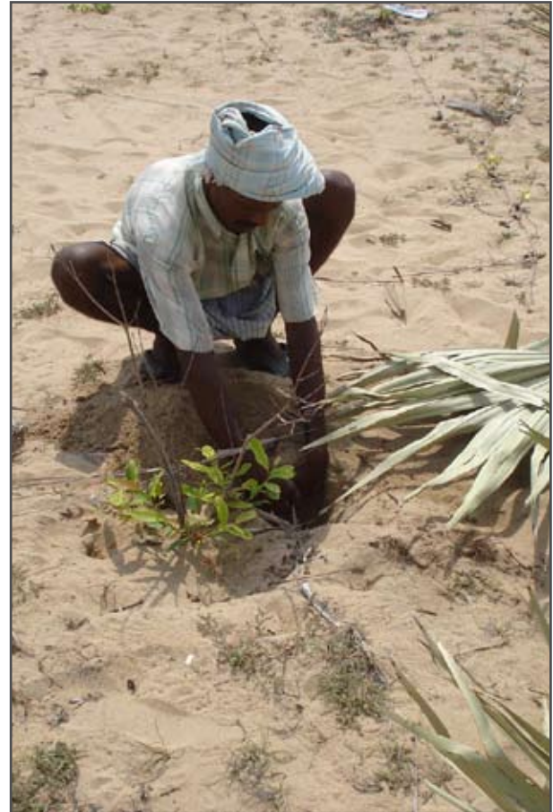
Putting up protection for a young seedling

Since the project began, a total of approximately nine acres of coastal land, in the villages of Anumanthai (North and South), Chettinagar and Notchikuppam, were planted with a combination of TDEF, non-TDEF indigenous and exotic species. Initially, the survival rate of the saplings was very low. Over the last two years, however, it has greatly improved. Today the overall survival rate is 92%.