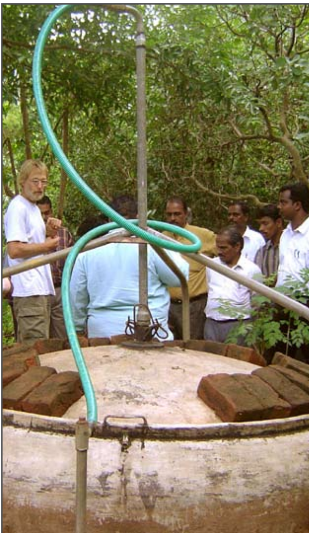
Workshop on Sustainable Habitats : Biogas technology

An important activity of AV NCKRC was providing advocacy in the following fields: beach erosion; the protective role of bio-shields; awareness on sanitation in relation to ground water contamination; the concept of regional planning; flood mitigation; technical support & implementation of different technologies, including GIS mapping. AV NCKRC also brought out several publications on various topics. These included posters, brochures, booklets and audio visual CDs. The issues addressed were solid waste management, flood mitigation, sanitation & hygiene, Effective Micro-organism technology and livelihoods.