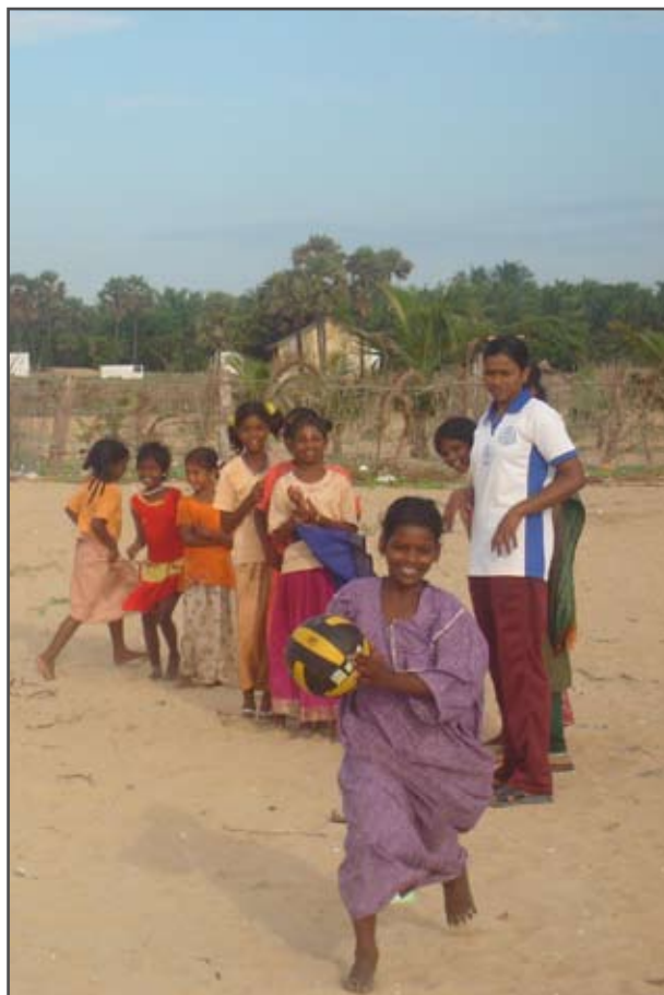
Having fun with ball games

communities. A total of 300 children participate in the programme. The SSF team collaborates with physical education students from Pondicherry University to train young volunteers from the communities where the programme is being implemented. Once trained, these volunteers will assume responsibility for the programme.