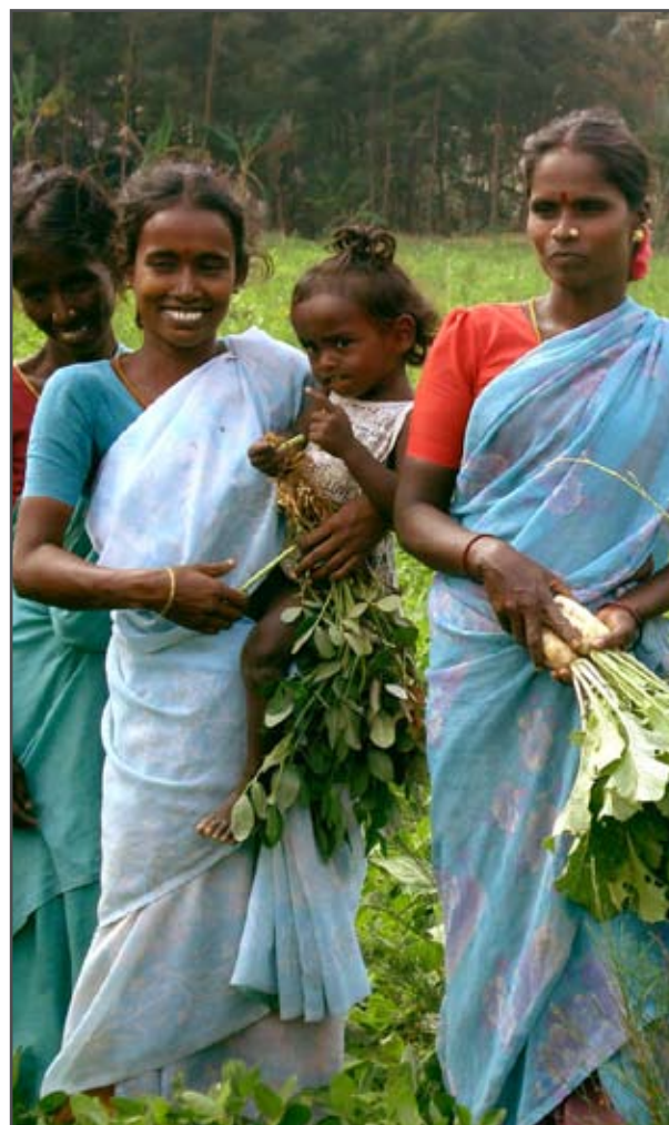
Agriculture as an income generating activity

AVAG's most important effort has been the setting up of Women Self Help Groups (WSHGs) to empower women at the individual and group level. Within their communities, these women often experience societal oppression. Being part of a WSHG gives women the confidence to make decisions at both the family and the community level.