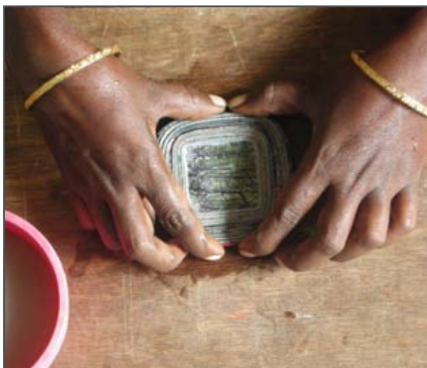
Finishing touches on a coaster

At WELL, a lot of importance is given to technical training, which lasts for a period of approximately six months. The women learn to create products using recycled materials, mainly newspaper. They are taught to roll newspaper into reeds, which they weave into baskets. Along with baskets of different shapes, sizes and colours, the present range of WELL products includes coasters, paper beads, jewellery and hair clips. 'Creative Days' are organised at the Centre, where the women who have already set up their own production units continue to come and experiment with different techniques and product designs, while having fun.